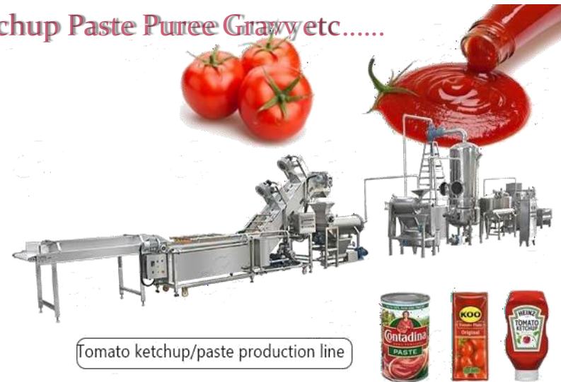
Tomato ketchup/paste production line