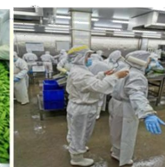
Figure 5 Packaging