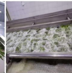
Figure 2 Washing