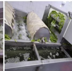
Figure 3 Cleaning and Removing hair