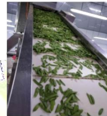
Figure 1 Wind selection