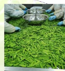
Figure 4 Sorting